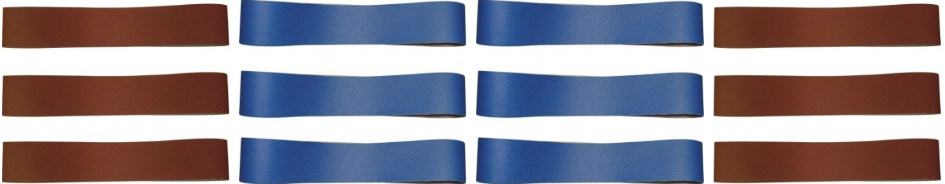
A8046 80G Aluminium Oxide Linishing Belt Pack