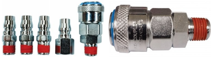
F941 High-Flow One Touch System Air Fittings