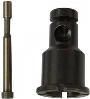
A082A Air Nibbler Cutter Set