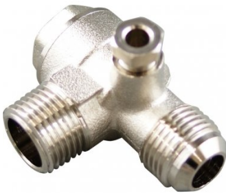
A230A Air Fittings