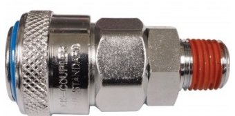
F941 High-Flow One Touch System Air Fittings