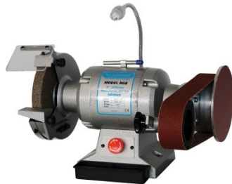
G156 Industrial Bench Grinder with Linisher