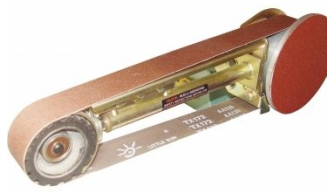
L088 Multitool Belt & Disc Linishing Attachment