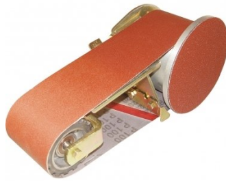
L087 Multitool Belt & Disc Linishing Attachment